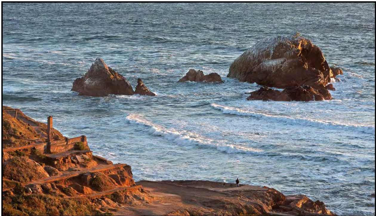
Land's End at Sunset

We photographed the brilliant glow of the setting sun, while a trumpeter sat on the rocks nearby and played taps into the gathering darkness.