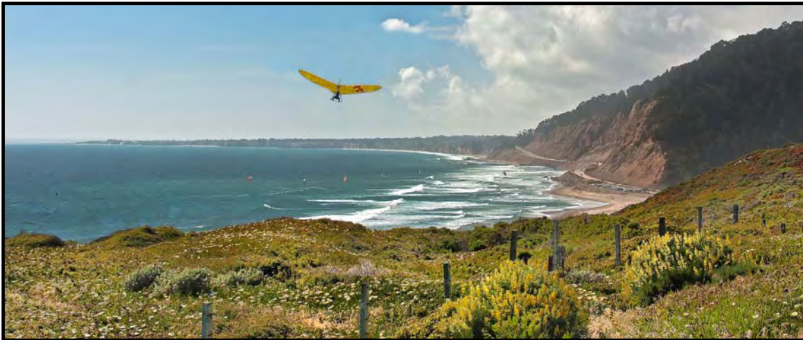
Hang Gliding Over Swanton Beach