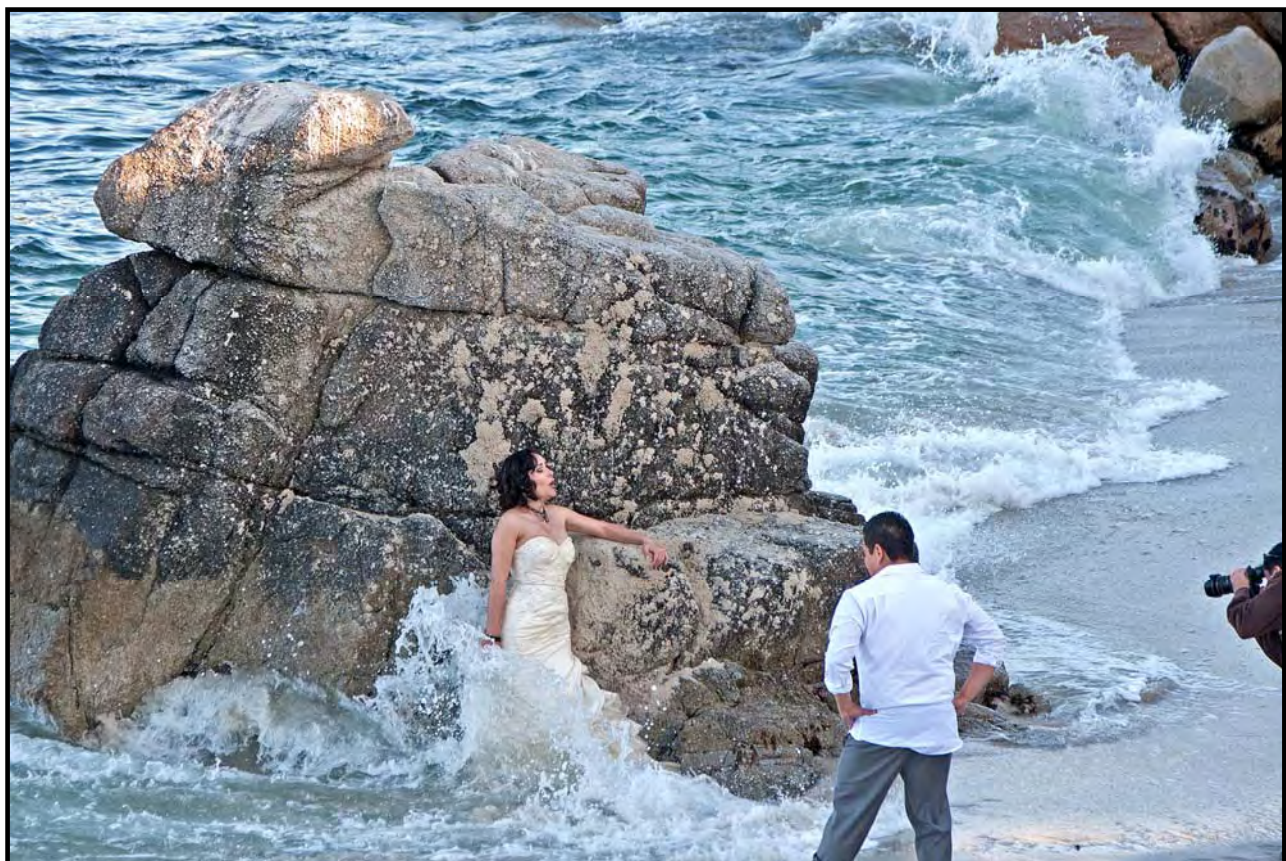
Wedding Shoot at Lovers' Point at Sunset