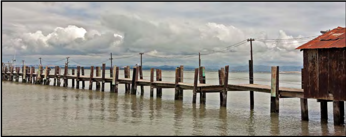
China Camp State Park, San Rafael, © PAT CORNETT