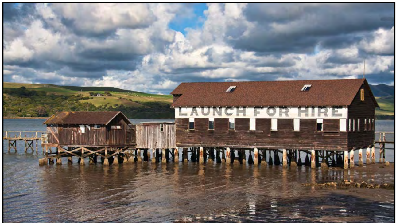
Inverness, Point Reyes National Seashore, © MEL ANNIS