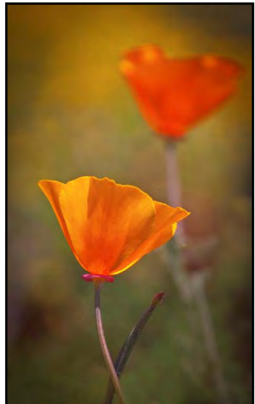
California Poppy

Stretching along a 17 Mile Drive at the outskirts of Pacific Grove, Asilomar State Beach is part of the Asilomar State Conference facility, where we stayed for three days.