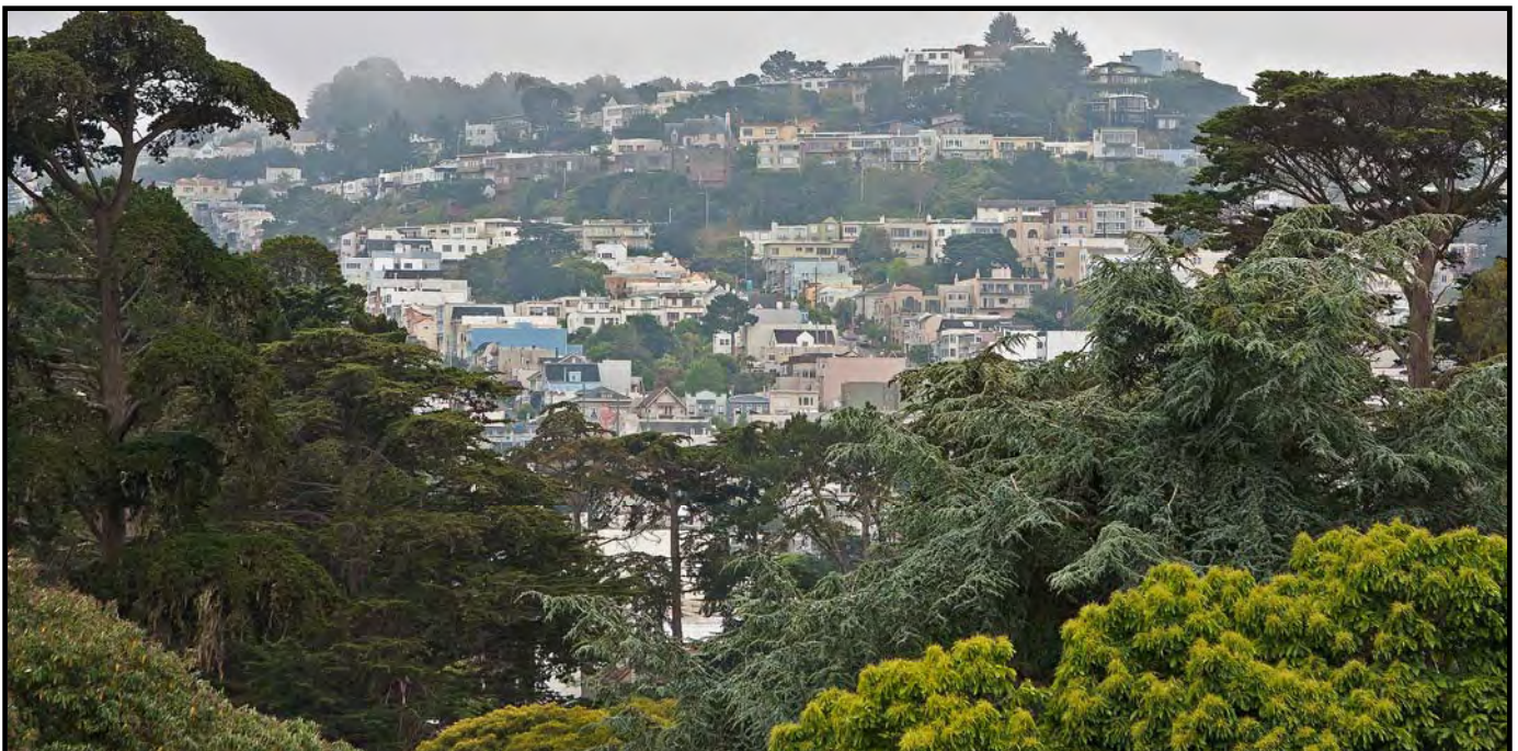
San Francisco in the Fog