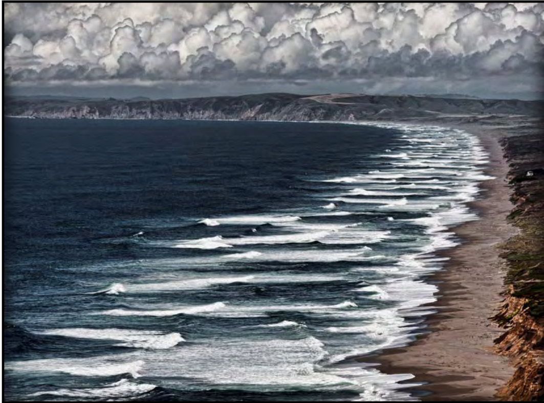
Point Reyes National Seashore, © MEL ANNIS