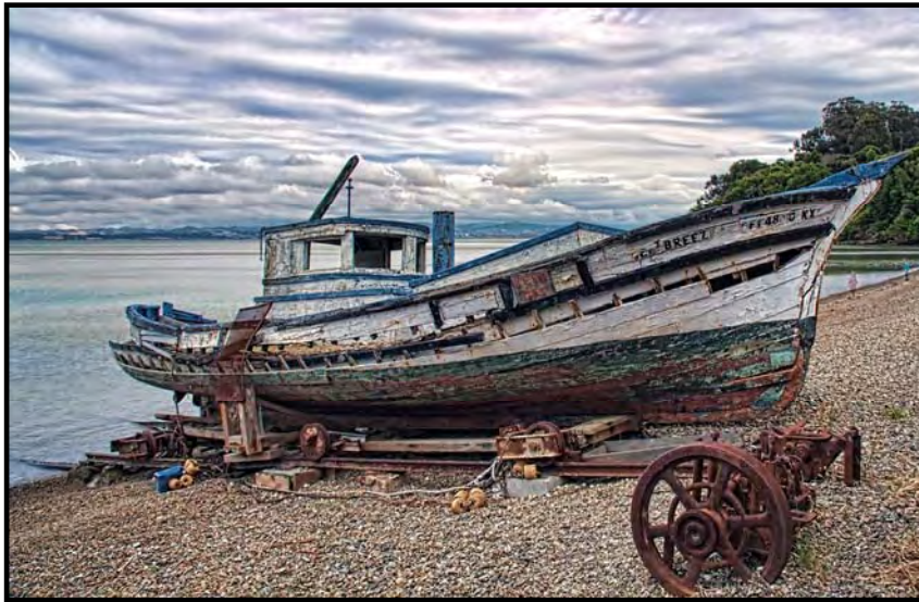
China Camp State Park