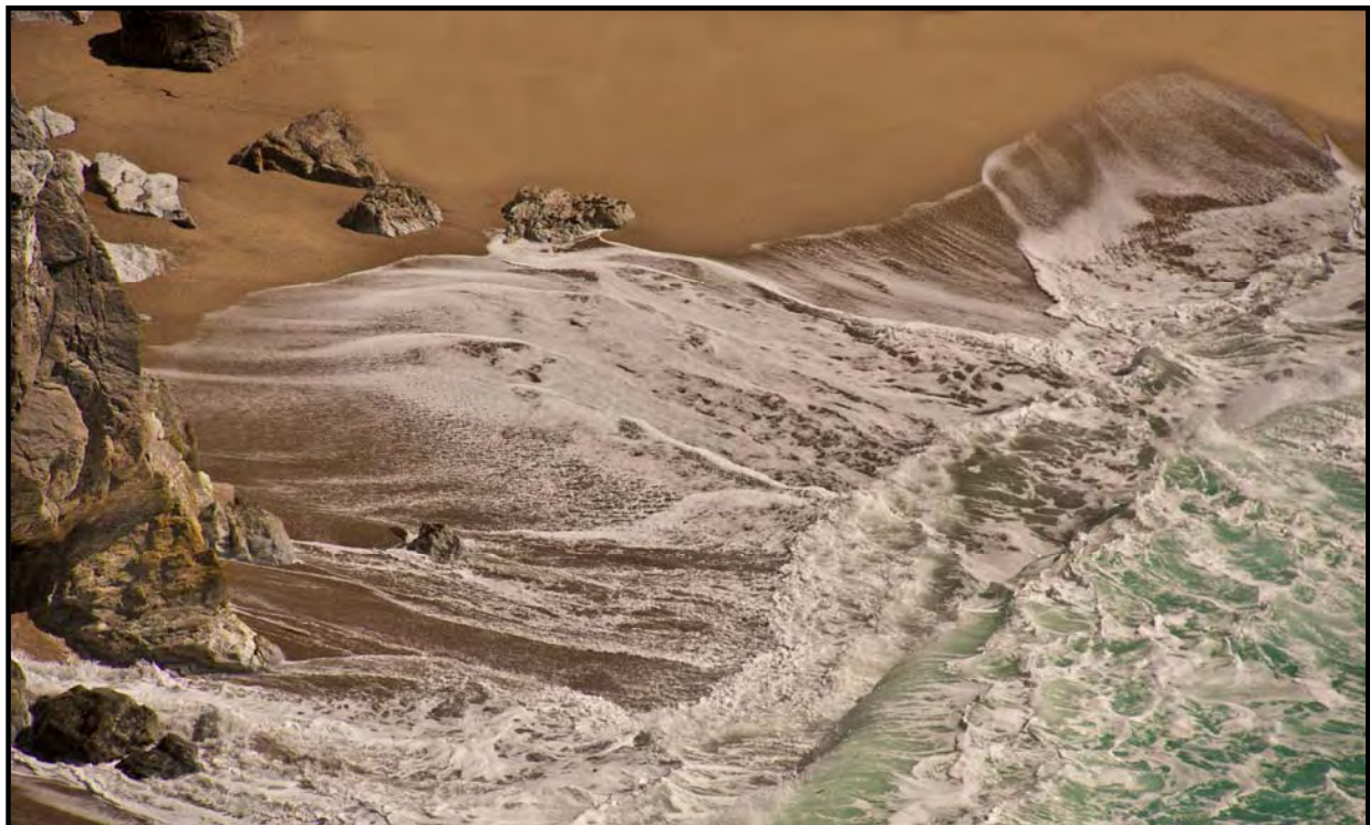
Asilomar State Beach, Monterey Peninsula