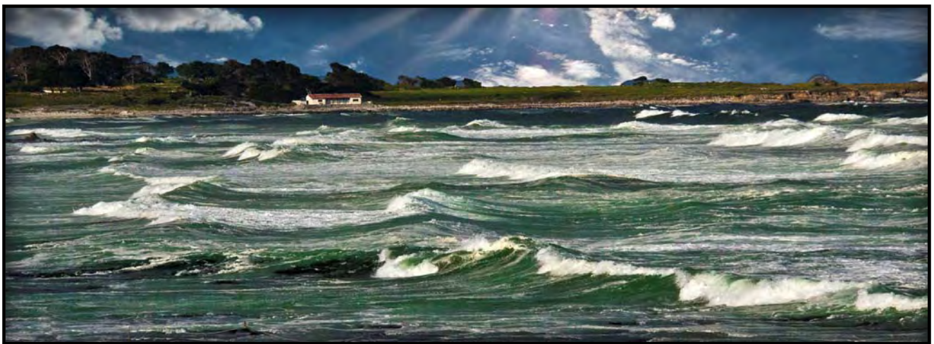
Big Sur Beach, California Coast