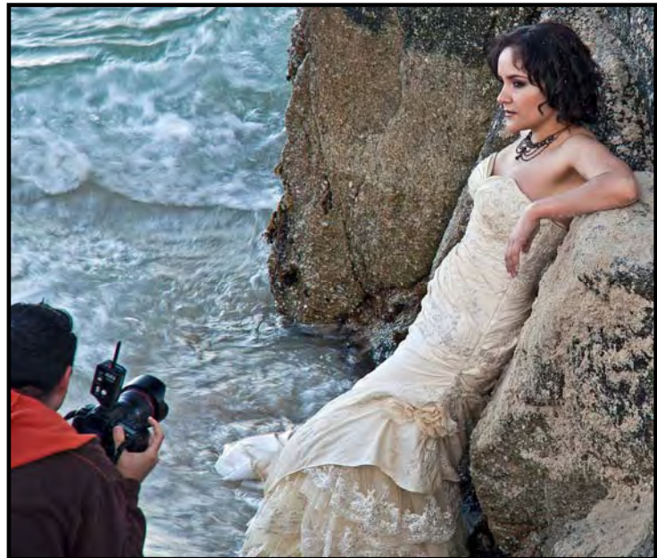
Wedding Shoot at Lovers' Point, © MEL ANNIS

At Swanton Beach (page 9) we saw two hang gliders on the beach getting ready to take flight. For 30 minutes or more, we watched them catch the currents high in the air above us.