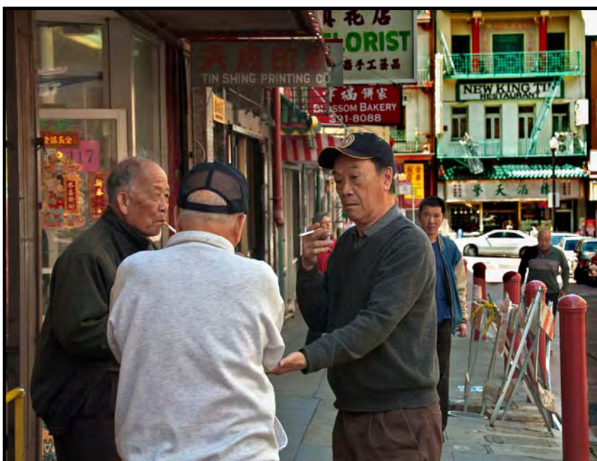
San Francisco Chinatown

Although not a wildflower, like the poppy, Calla lilies grow wild everywhere along the coast of California.