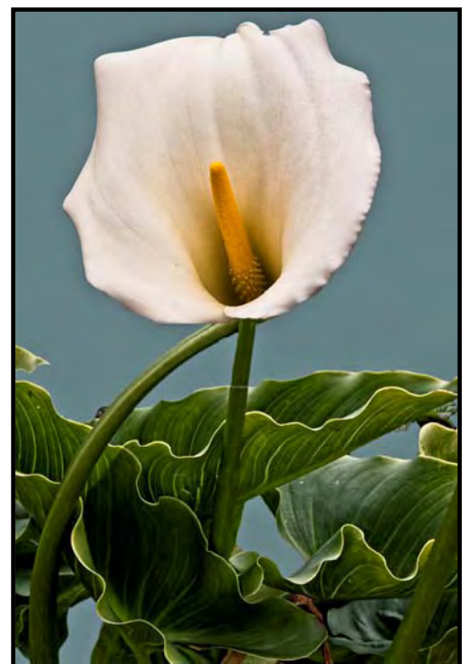
Calla Lily, © MEL ANNIS